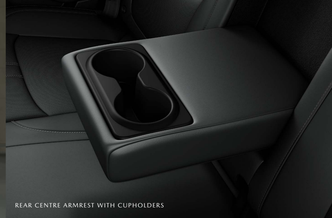
REAR CENTRE ARMREST WITH CUPHOLDERS