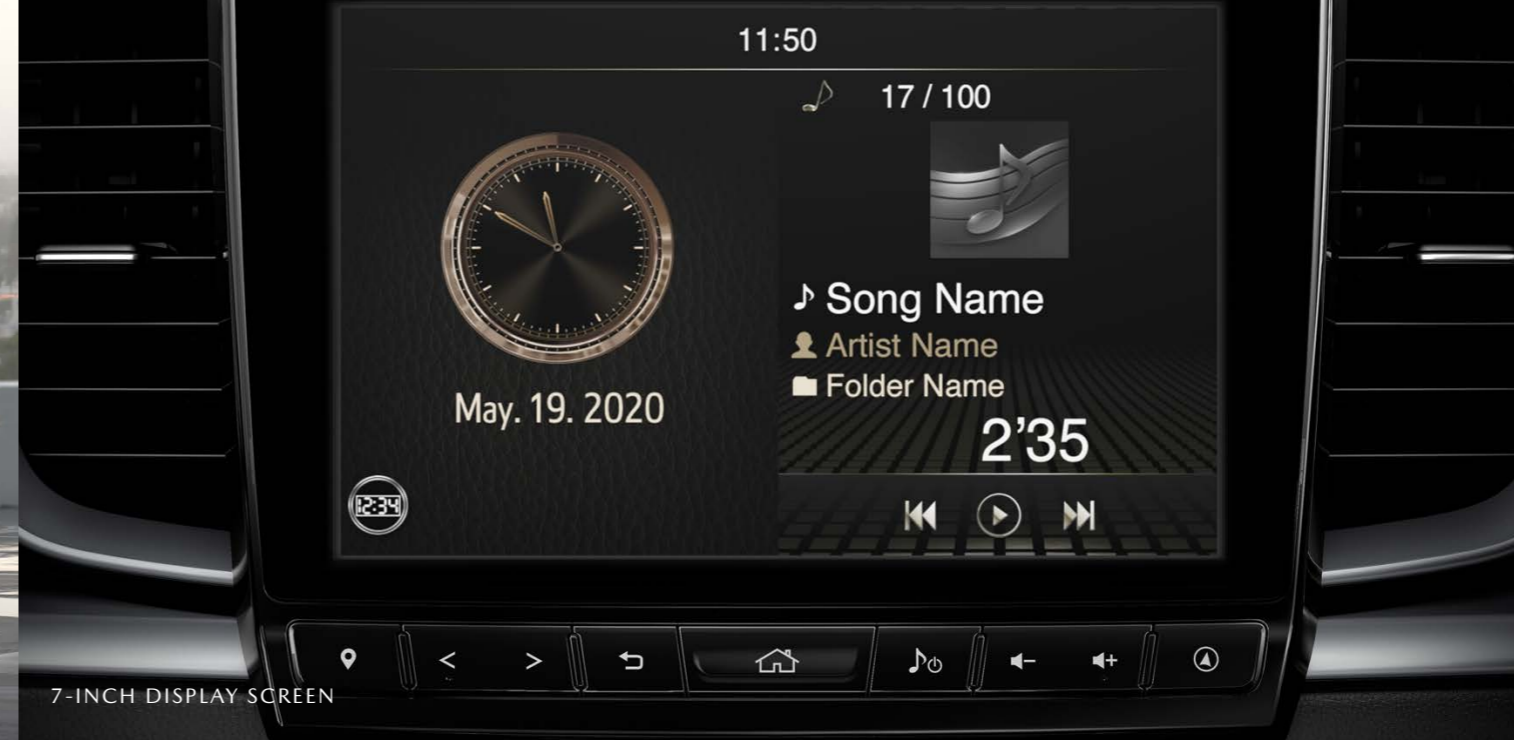
7-INCH DISPLAY SCREEN