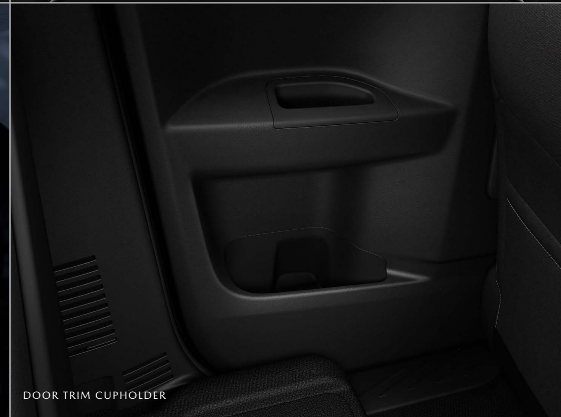
DOOR TRIM CUPHOLDER