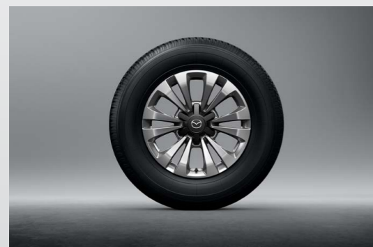
ACTIVE 17" Alloy Wheels (Grey Metallic)