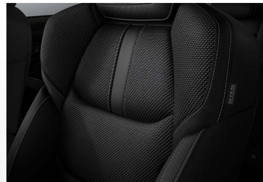
ACTIVE, DYNAMIC & INDIVIDUAL MODELS Black & Dark Grey Cloth

Step inside the comfortable, spacious, durable cabin and immerse yourself in the highest quality Mazda design. Soft black cloth seats, all complemented by premium interior materials.