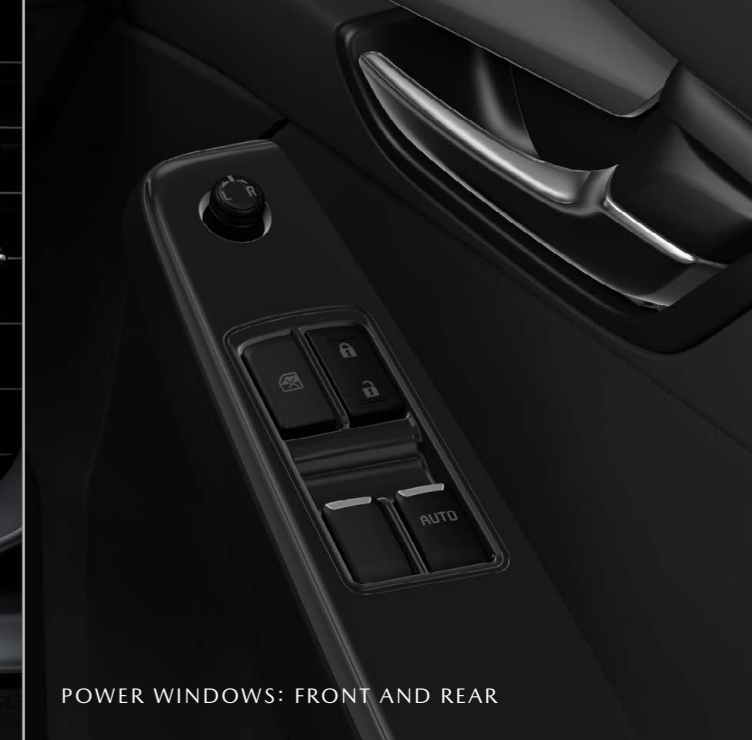
POWER WINDOWS: FRONT AND REAR