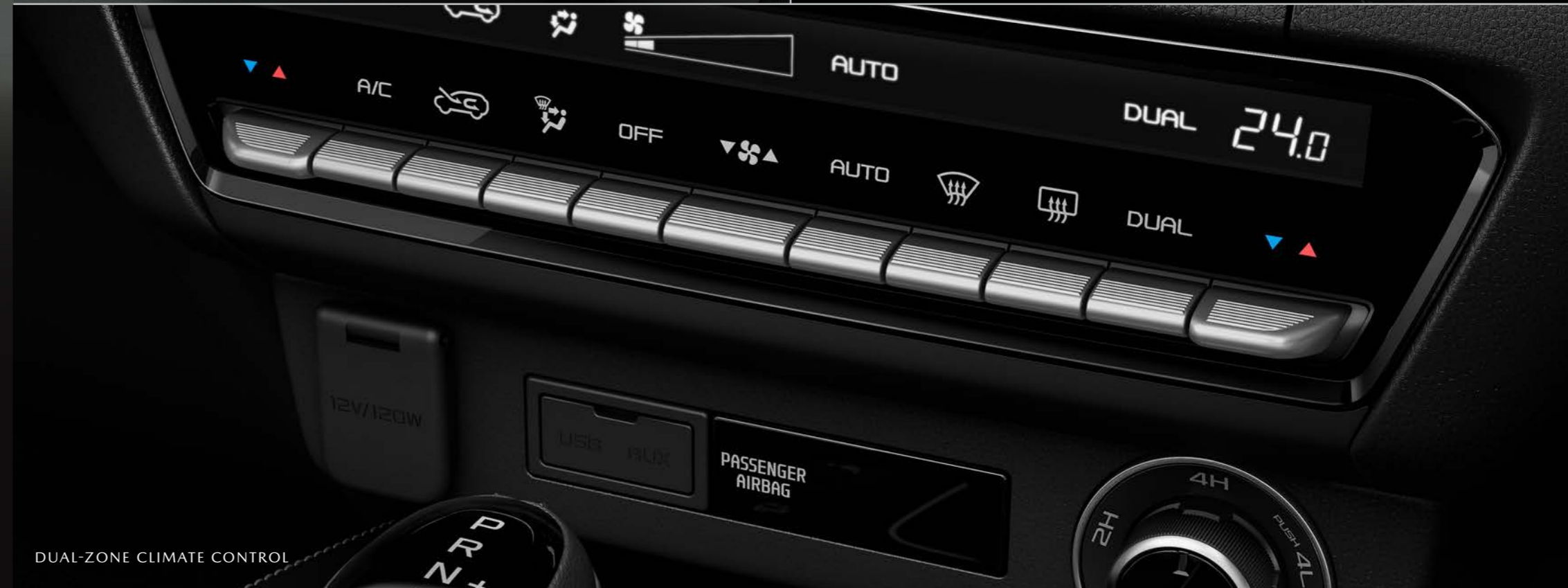
DUAL-ZONE CLIMATE CONTROL