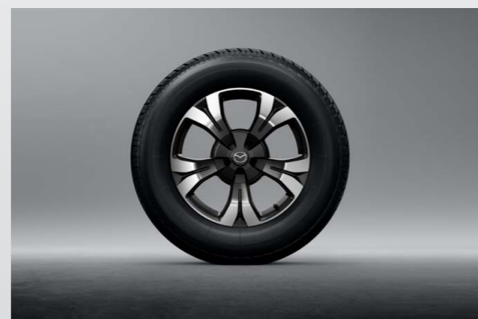
DYNAMIC & INDIVIDUAL MODELS 18" Alloy Wheels (Grey Metallic)