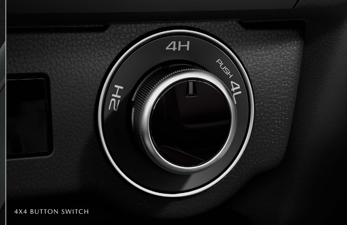
4X4 BUTTON SWITCH