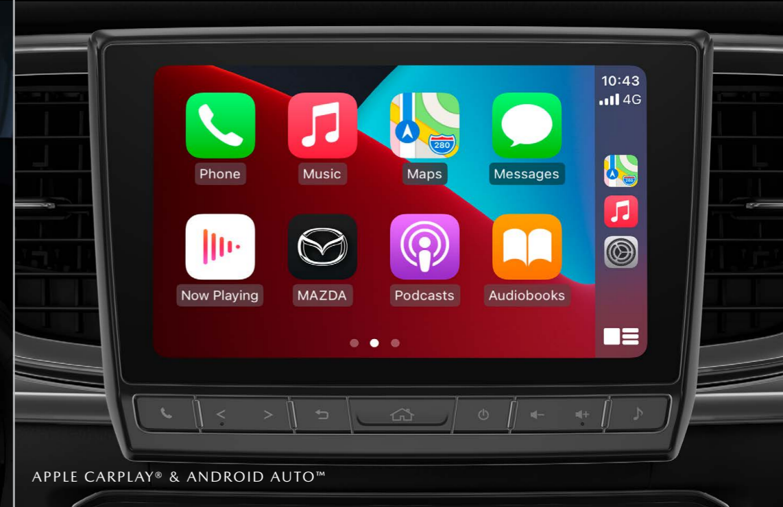
APPLE CARPLAY® & ANDROID AUTO™