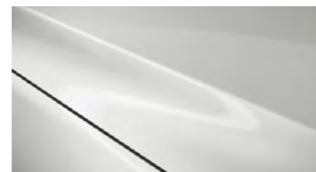
SNOWFLAKE WHITE PEARL