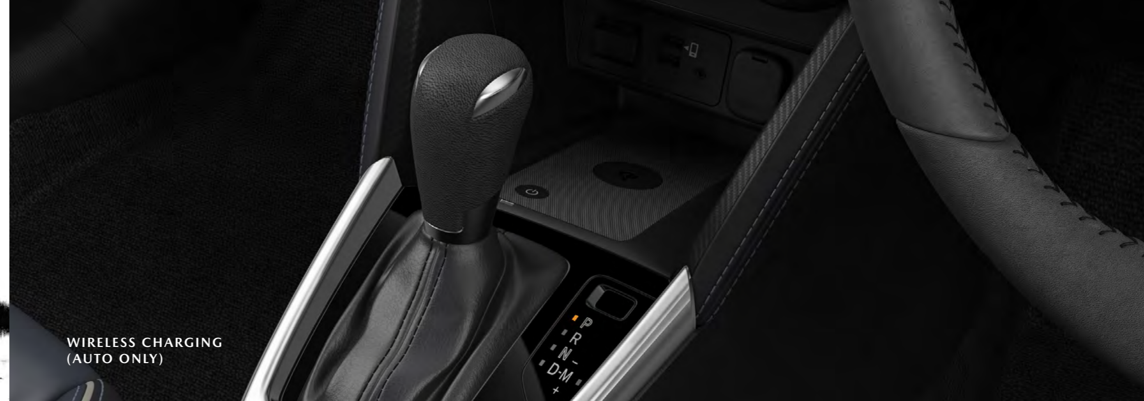
WIRELESS CHARGING (AUTO ONLY)