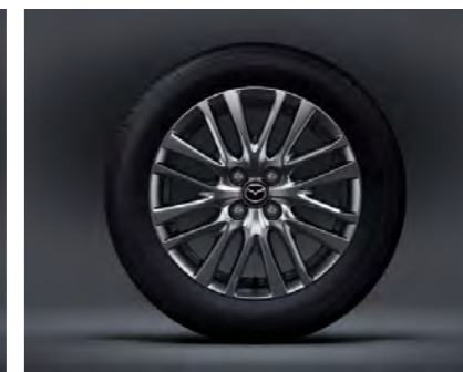
16" Alloy Wheels (Bright)