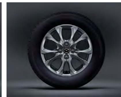
15" Alloy Wheels (Silver Metallic)