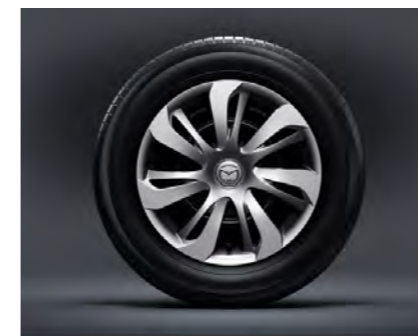
15" Steel Wheels (Black)