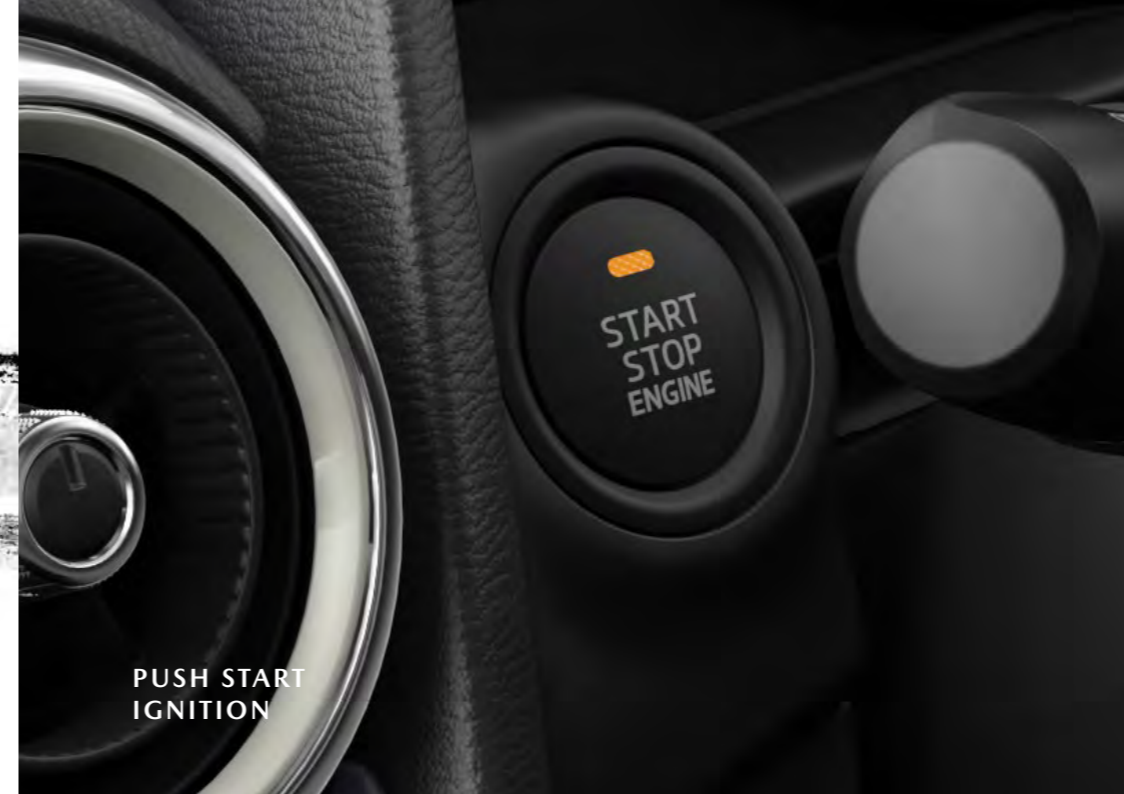
PUSH START IGNITION