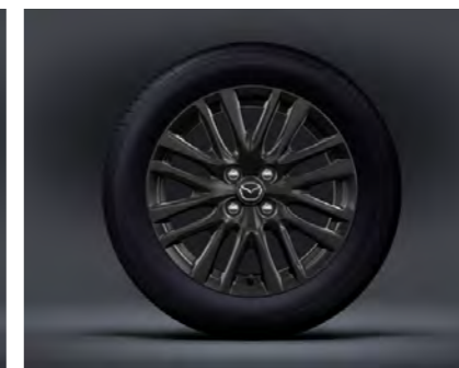
16" Alloy Wheels (Black Metallic)