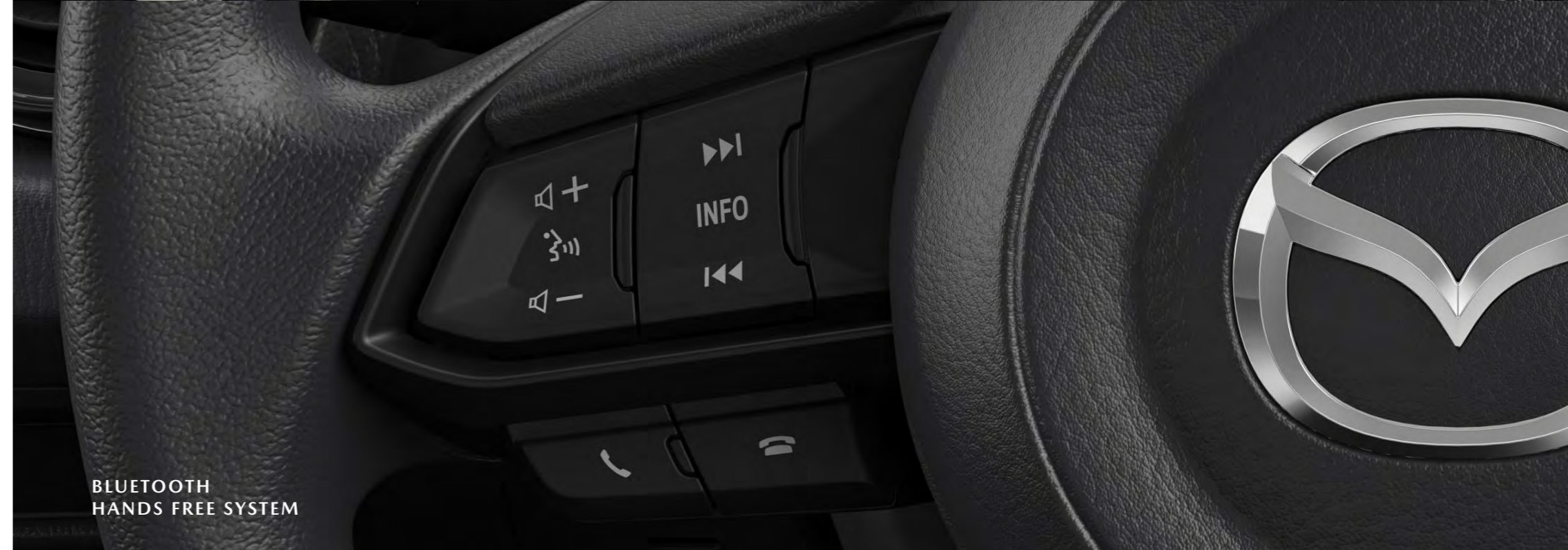
BLUETOOTH HANDS FREE SYSTEM