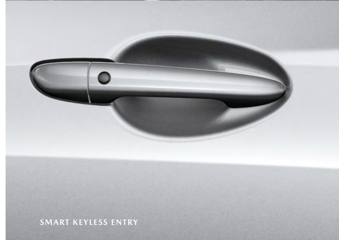
SMART KEYLESS ENTRY