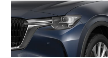
DEEP CRYSTAL BLUE