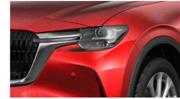
SOUL RED CRYSTAL