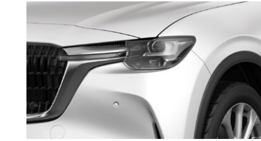
RHODIUM WHITE METALLIC